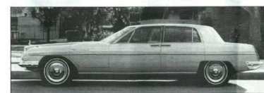
OUT ON THE TOWN. The only picture taken of one of the 61 '65 Packards in public. The occasion was the last day of activity after the Studebaker plant closed. It was taken just before the car was sold. This is 1962 and its quite different model, perhaps, has been a design guide at the time for several recent Packards. Do you suppose it sold well?

The last design for Packard but did not go to production.